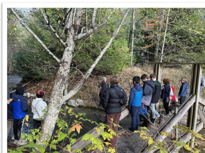
Grade six students explore the salmon life cycle as part of the Outdoor School Program.

instruction supports intellectual development, while teaching self-awareness and self-management skills contribute to the mental health and well-being of students, staff, and parents.