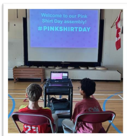
Pink Shirt Day assembly to promote acceptance for all.