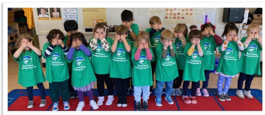
Kindergarten students sharing their new 'Queensbury Kindergarten Crew' t-shirts.

Education at Queensbury offers every child equal opportunities to develop the knowledge, skills, and attributes necessary to reach their full intellectual, social, and physical potential.