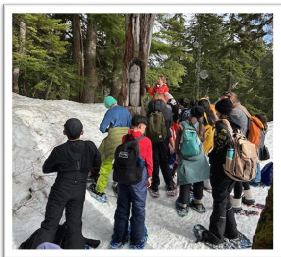
Grade 5/6 students learn about local history through outdoor education at Grouse Mtn.

In essence, enhancing a sense of belonging at Queensbury is vital for creating a safe and nurturing environment that enables all members of the community to thrive and realize their full potential.